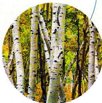
UNINTENDED CUT: Removing gray wolves from Yellowstone National Park allowed a boom in elk, which dined on aspen leaves, killing many young trees.

ators had massive impacts on food webs. The slaughter of wolves around Yellowstone National Park led to a boom in elk and other herbivores. The elk feasted on willow and aspen leaves, killing many trees. Likewise, off the eastern U.S. coast, fishers have devastated oyster and scallop populations without catching a single one. Instead they have killed sharks in huge numbers, allowing the smaller predatory fish the sharks fed on to thrive. The population of cownose rays, for example, has exploded. Cownose rays feed on bottom-dwelling shellfish, and as a result, their boom has led to a crash in oysters and scallops.